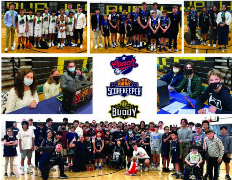
PVYBL is not related to, sponsored by, or endorsed by the Palos Verdes Peninsula Unified School District

Make a difference in the lives of 1,500 kids while earning volunteer hours! Season from December 7, 2024 to February 16, 2025 Mandatory training on Sunday, October 27, 2024 Visit PVYBL.com for details